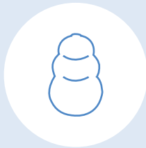
PEANUT BUTTER KONG