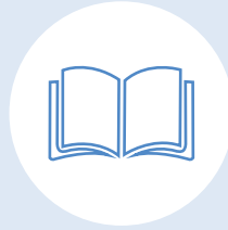
BEDTIME STORY/ TUCK-IN SERVICE